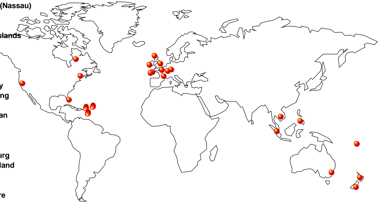
Red Dots = Installed Customers